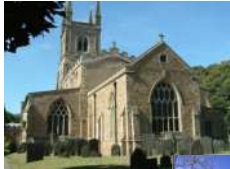
St Mary's Lutterworth