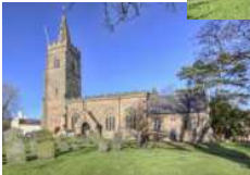
St Mary's Bitteswell