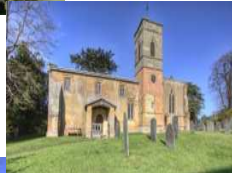
St Mary's Cotesbach